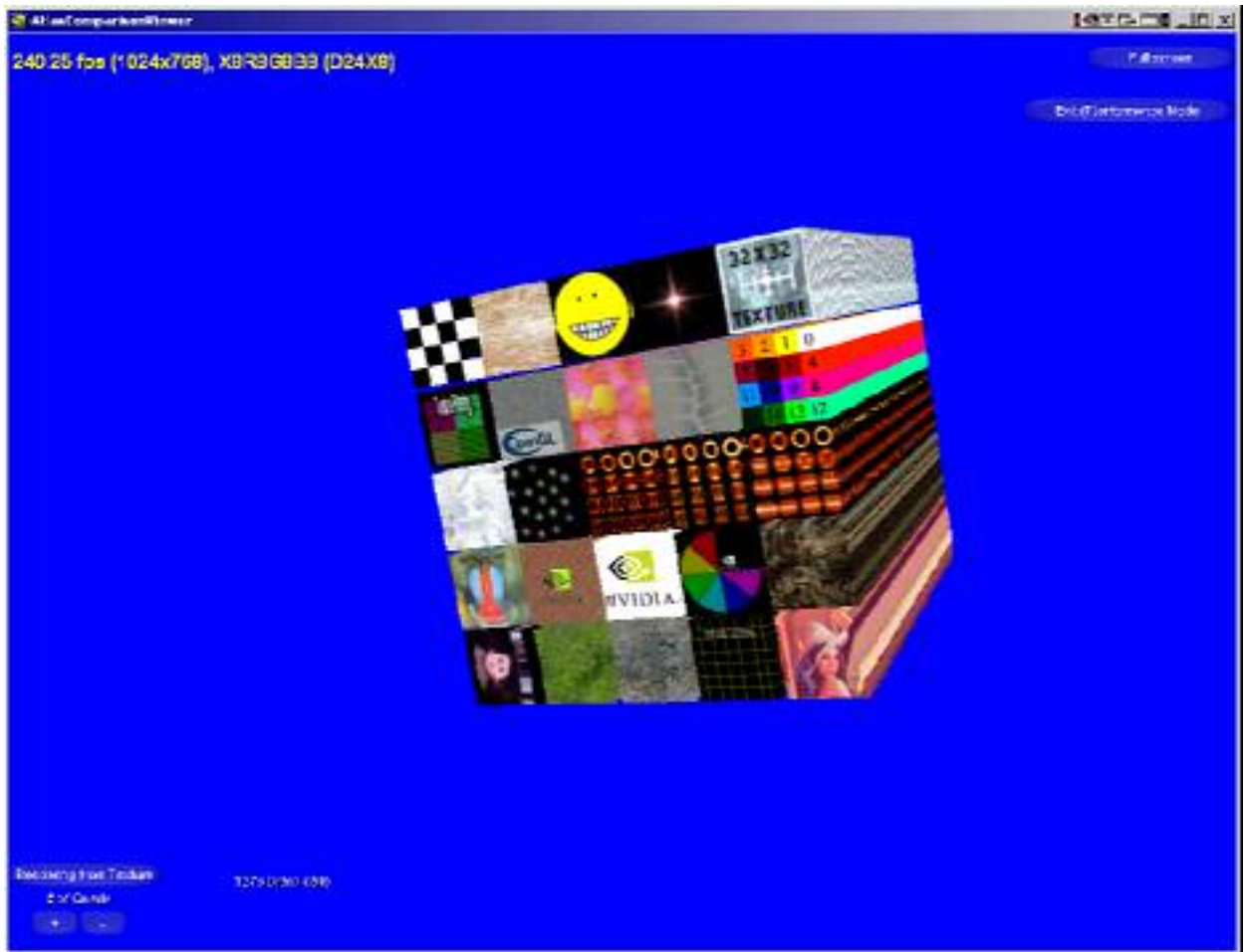
Figure 3. Performance-Visualization Mode